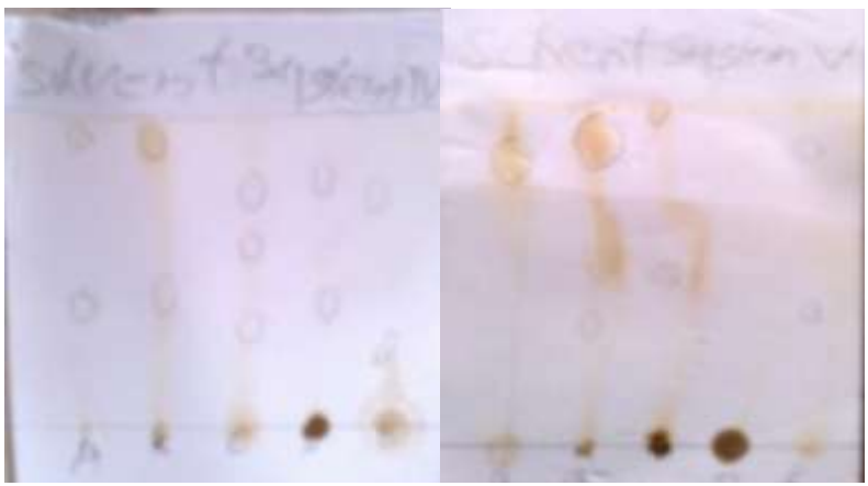
Solvent System IV Solvent System V Figure 1: Photographs of thin layer chromatographic studies